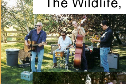
Site of IWFF Dance Party on May 14, 2010

Stay Where the Action Is! The Wildlife, Horseback Riding, Fishing, and Party Action!